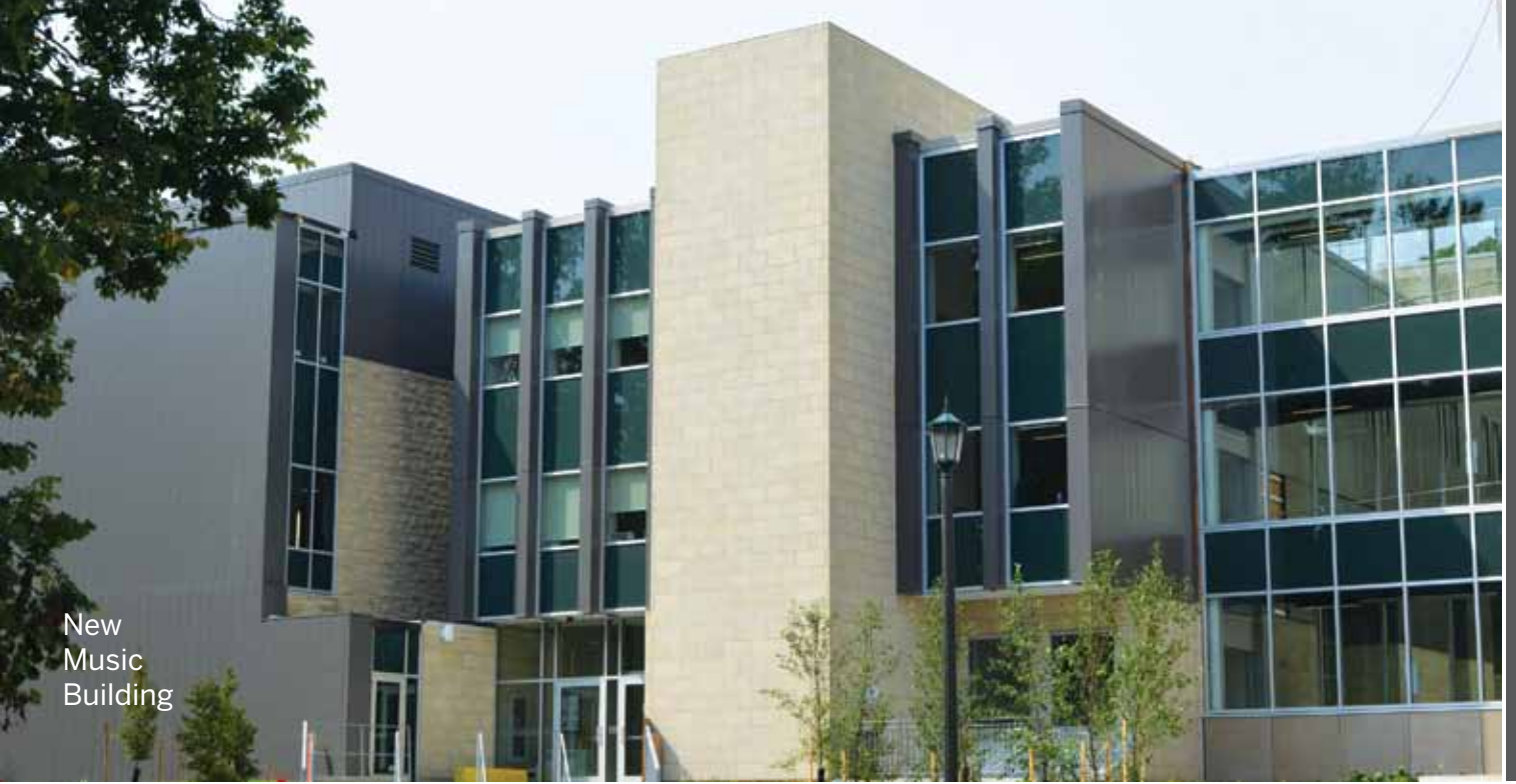
New Music Building